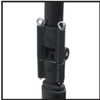
9 - FINAL ASSEMBLED VIEW. (Screws facing outward)