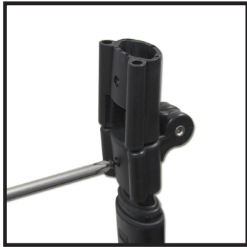
5 - Insert screw into bottom half of hinge piece.