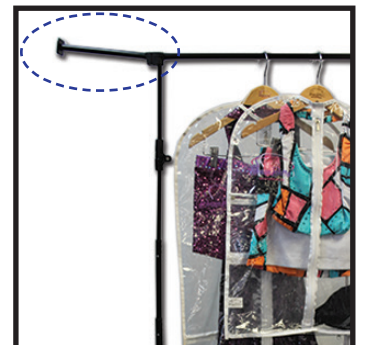
NOTE: 8.5" Garment Rack Extension will work with your Relevé.