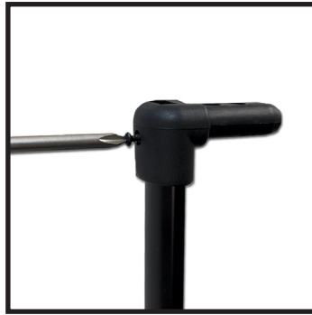
2 - Unscrew top end piece.