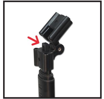
4 - Slide shorter side of hinge piece over top button so that it comes through hole.