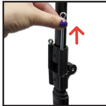
1 - Remove silver locking pins