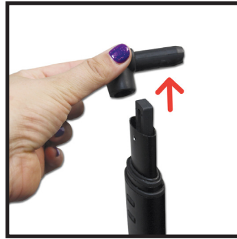
3 - Remove top end piece by pulling up and off. The top button should be showing.