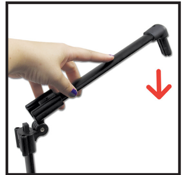
2 - Fold extension arm down so that top end piece is touching rack.