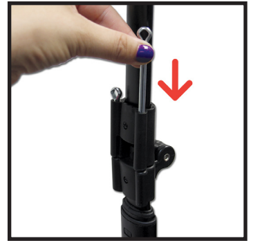
8 - Insert silver locking pins to secure (as shown above).