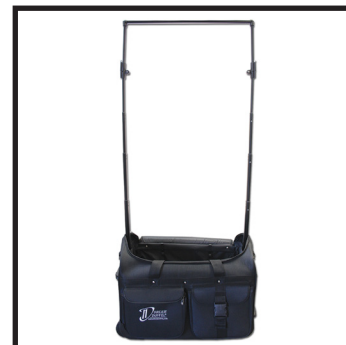
Relevé adds 10" to your rack to make it a total of 62" - from floor to garment bar!