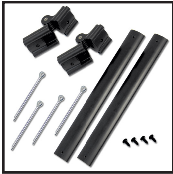
1 - Parts you'll receive.