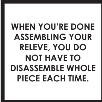
Follow next steps for Relevé take-down and storage.