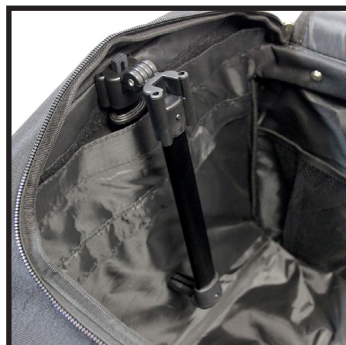
4 - Extension folds down and stays attached to rack when not in use.