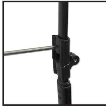
7 - Insert extension bar into top of hinge piece, line up holes, and insert screw.